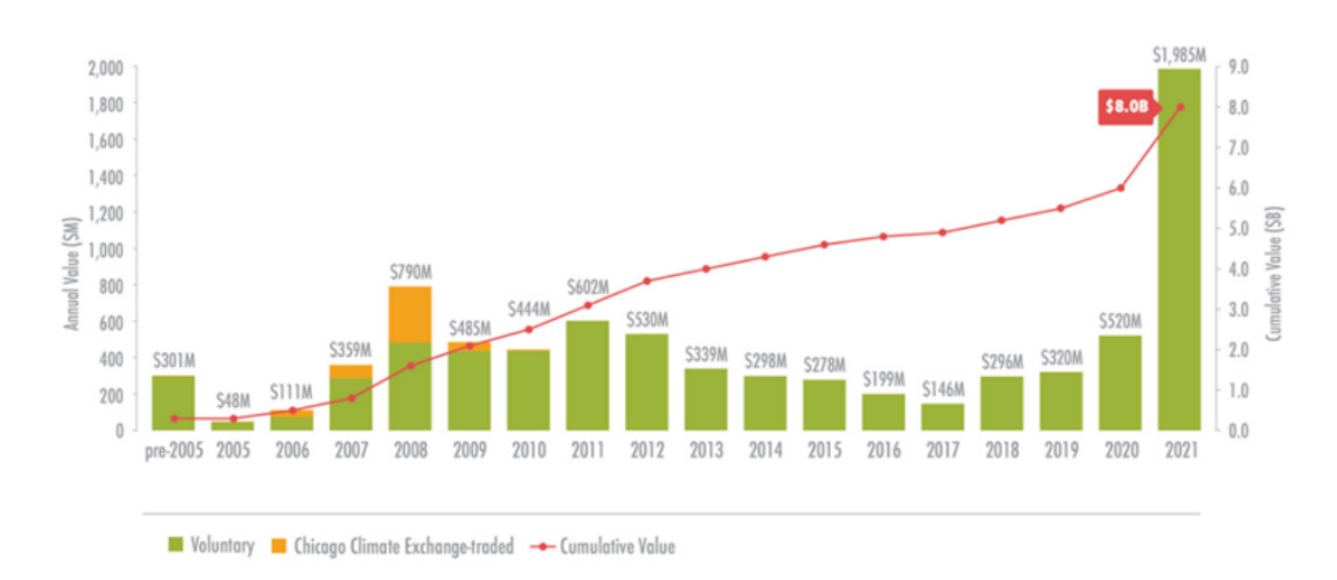
Figure 5: Size of the VCM by traded value of voluntary carbon offsets, pre-2005 to 31 December 2021<sup>6</sup>