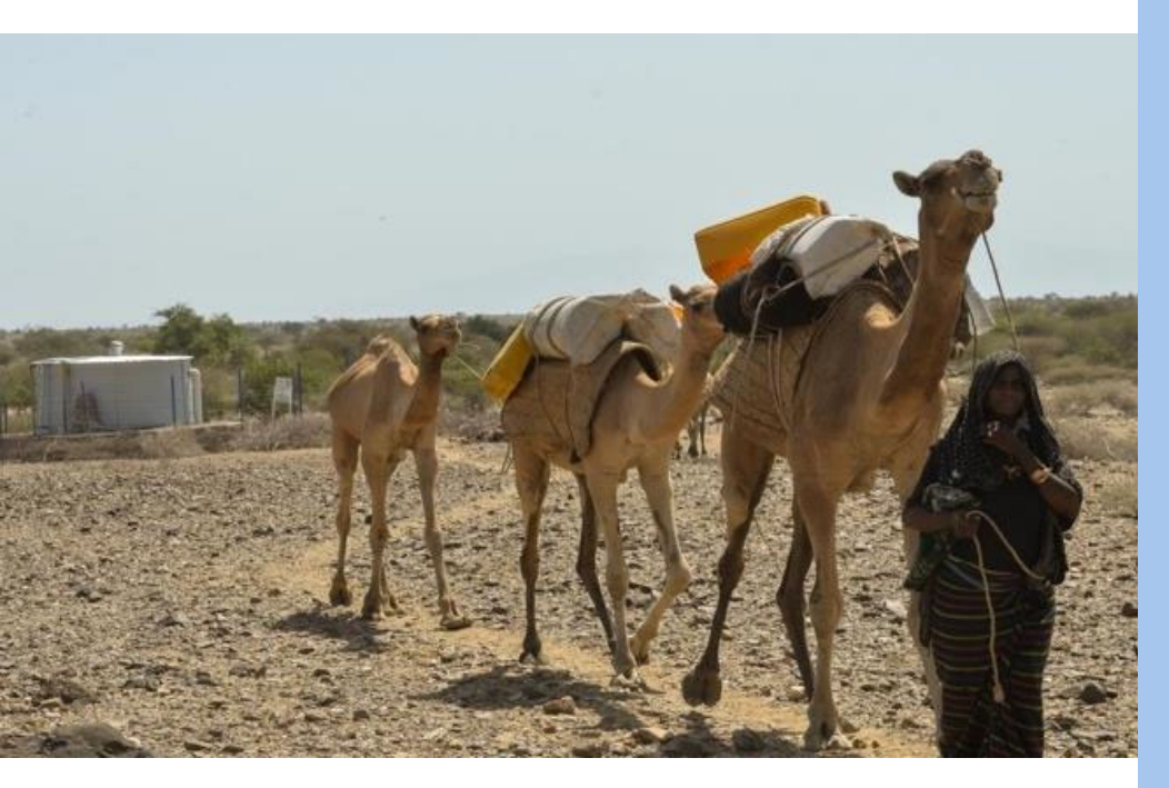
Pastoralist communities in South Omo dealing with water access challenges exacerbated by climate change also face hardships with access to supply chains for sanitation and MHM products.

Assessing Menstrual Health Management in Girls of Pastoralist Communities in Ethiopia's Remote Southern Nations Nationalities and People Regions